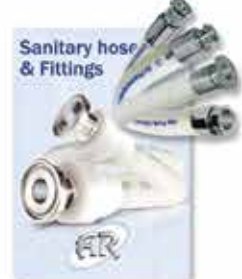
SILICONE HOSE & FITTINGS