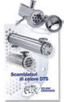
DTS HEAT EXCHANGERS