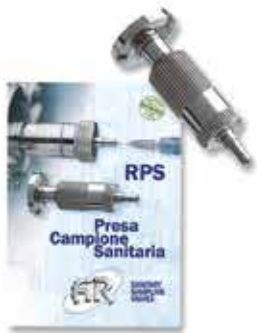
SANITARY SAMPLING VALVES