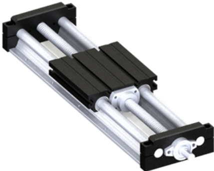
Body ; Profile (Aluminium 6063) Positioning Accuracy ; 0,2 mm