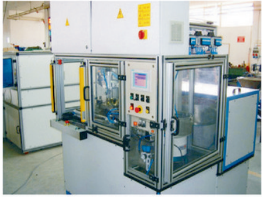
Press Printing Protection Cabinet