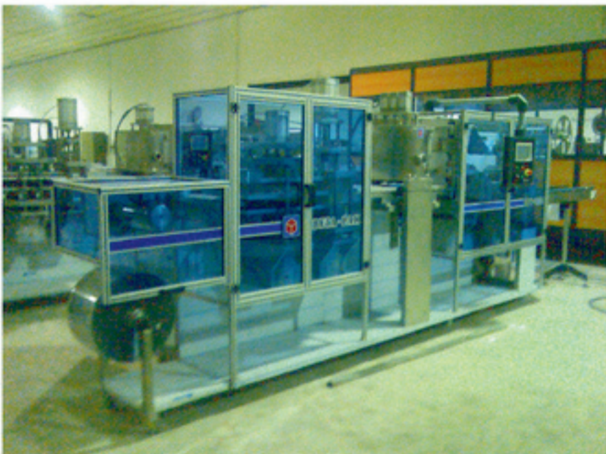
Termaform Machine Protection Cabinet