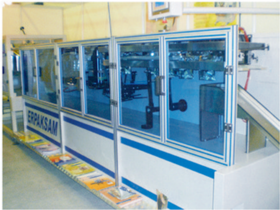
Production line Protection Cabinet