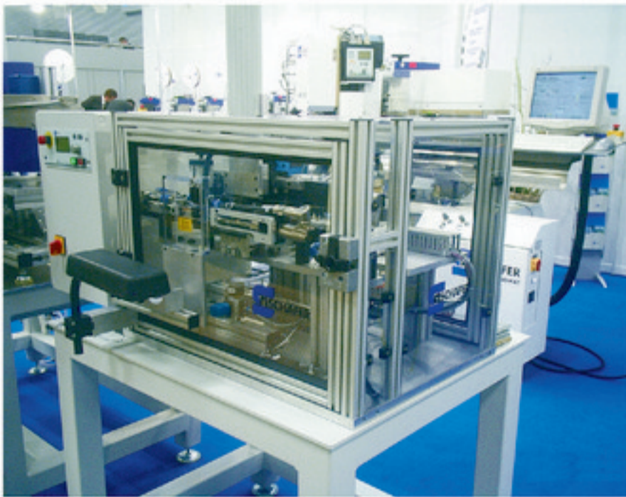
Pneumatic System Protection Cabinet