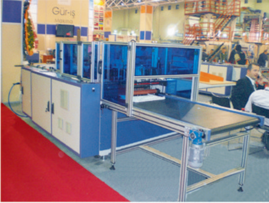
Bag Manufacturing Machine Cabinet