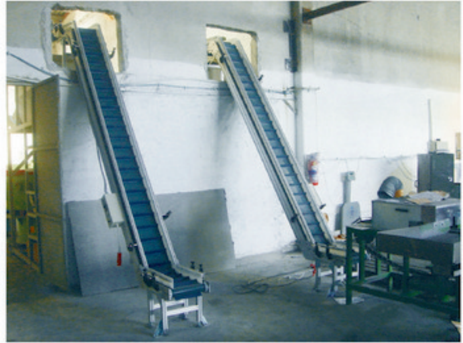
(L) Type Elevator