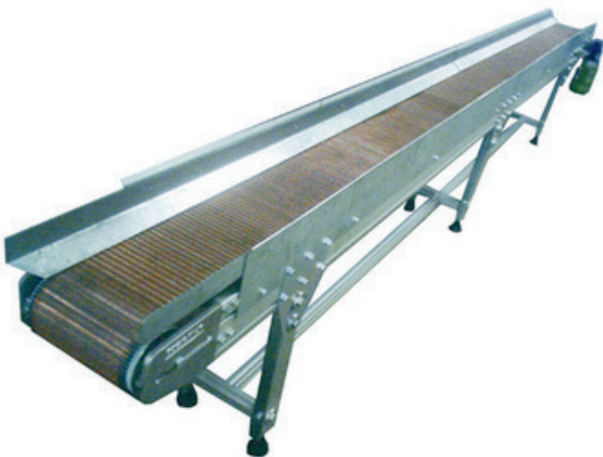
Wire Belt Conveyor