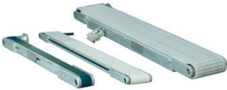
Varied Belted Miniature Conveyors