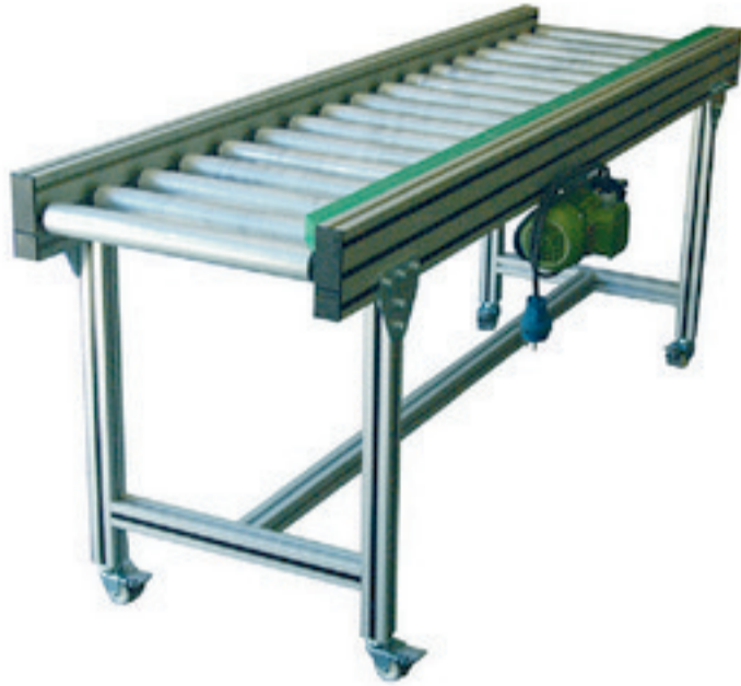
Chain Roller Drive Conveyor