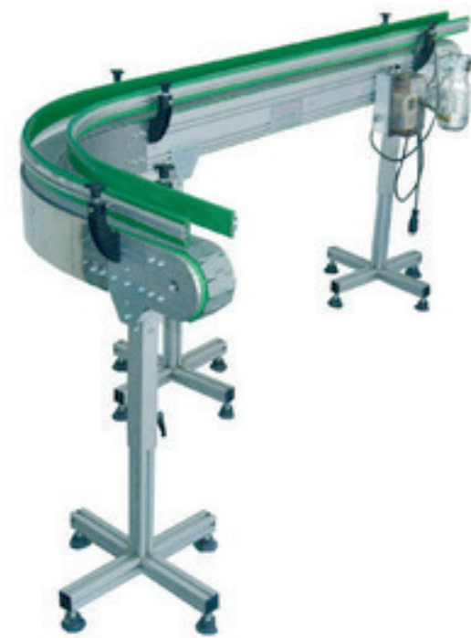
Acetal Belt Conveyor