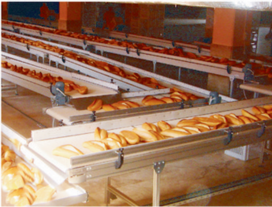
Bakery Output Line