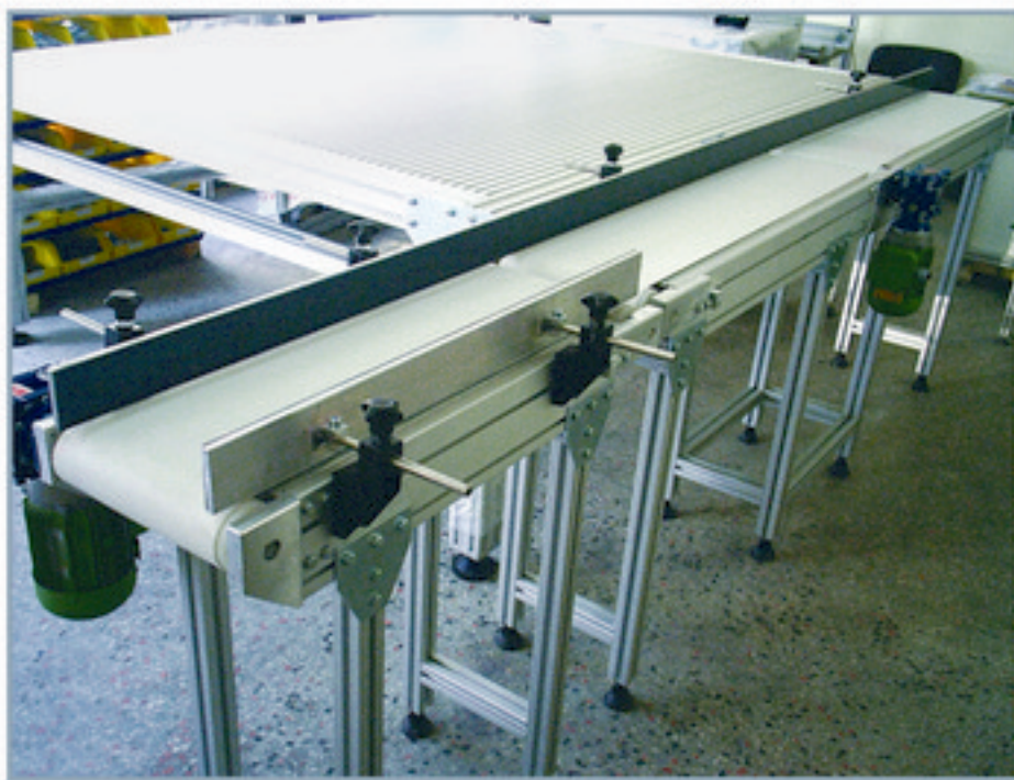
PVC Belt Conveyor