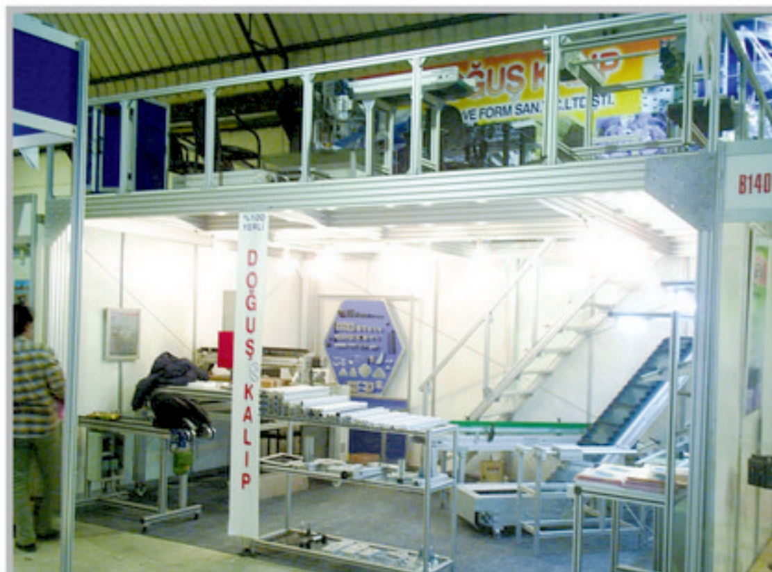
4x6 mt Double Storey Exhibition Stand