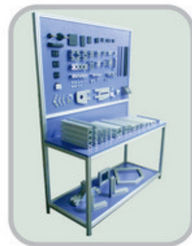
Product Display Panel