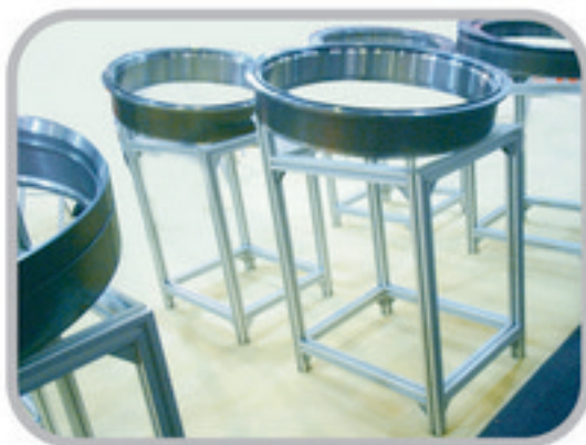
Product Display Panel